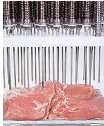
Figure 3: Brine injection needles.

More rapid curing can be achieved by injecting the meat with brine before tank curing. This brine is slightly stronger and contains 30 kg salt per 100 litres of water and the same amount of sodium nitrite/nitrate as tank brine. The meat should be injected in about 20 places, deep into the meat, which causes the meat to increase in weight by 8 -10%. At larger scales of operation an electric injection pump (Fig. 3) that has 5 - 10 needles can be used. After injecting the brine, the meat is cured in a tank as above.