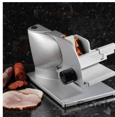
Figure 4: Bacon Slicer.

After curing, the meat is allowed to dry and mature under refrigeration at below 5°C for approximately 5 - 7 days. The humidity in the room should be kept at approximately 85% by keeping the floor wet with saturated brine (not water) at all times (saturated brine gives an air humidity of 75%). Bacon is then sliced to the required thickness using a manual or electric meat slicer (Fig. 4.). It can be wrapped in greaseproof paper if it is sold quickly, or sealed in either plastic bags or plastic trays with heat-sealed plastic covers. It is stored under refrigeration for retail display for about 2 -3 weeks. Vacuum packing extends the shelf life further, but vacuum packing machines are expensive to buy and to maintain, and they are only suitable for processors that can justify the expense with high levels of profitability.