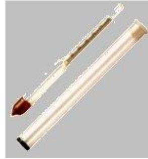
Figure 5: Salometer used to test brine strength

The main QA checks are to accurately weigh meat and curing salts to ensure that the correct concentrations are used in the brine. A ‘salinometer’ is a type of hydrometer that is calibrated to measure the concentration of salt in brine (Fig. 5). A sample of brine is placed in the testing cylinder, usually at 20°C, and the glass salinometer is allowed to float in the brine. The reading is taken from the stem of the salinometer and converted to % salt using conversion tables supplied with the equipment. If no salinometer is available, the correct brine strength is one that will just float a fresh egg or a freshly peeled potato.