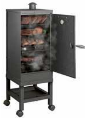
Figure 6: Meat Smoker.

More sophisticated smokers have fans to control the amount of smoke from the generator and to evenly distribute smoke in the smoking chamber.