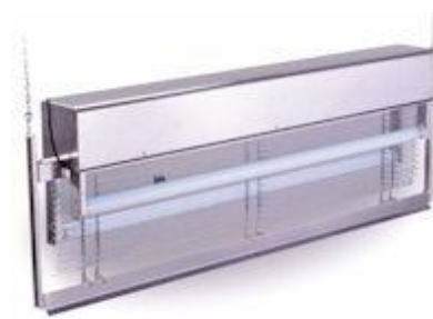
Figure 1: Insect electrocutor.

Opening windows should be screened with mosquito mesh. Thin metal chains or strips of plastic can be hung from door lintels to deter flying insects, or alternatively, mesh door screens can be fitted. A panelled ceiling should be fitted rather than exposed roof beams, which would allow dust to accumulate that might contaminate products. There should be no holes in the ceiling or roof, and no gaps where the roof joins the walls, which would allow birds and insects to enter. One or more insect 'electrocutors' (Fig. 1) should be hung from the ceiling in the processing room.