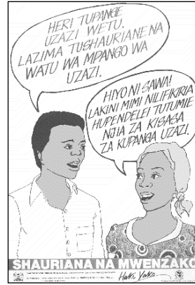
A poster promoting family

In December 1998, the project team asked a sample of women's group leaders to identify the civic education needs of their communities. These women were later invited to Nairobi, along with local chiefs, for a meeting. After the meeting, the group leaders began developing education materials. They chose posters as the best medium because of the semi-literate nature of their communities. The women identified 10 issues of concern, and those issues dictated the design of the posters.