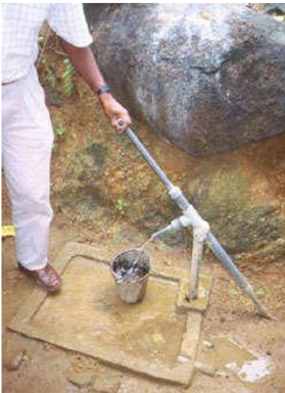
Figure 2: The Tamana pump installed at Batalahena Sri Lanka